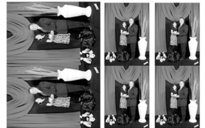
1-8X10, 2-5X7, 4-3.5X5, 8 WALLETS