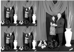
1-5X7, 4 WALLETS