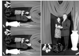
1-8X10 1-2X7 2-3.5X5 8 WALLETS