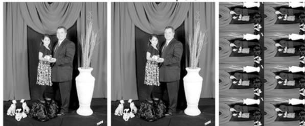
PACK E $65