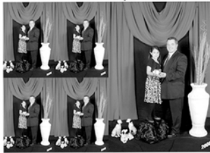
PACK B $30