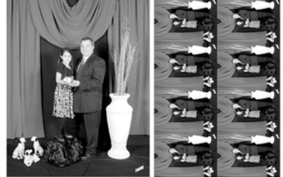
PACK C $35