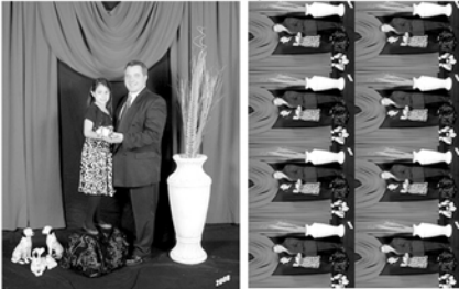
PACK D $45